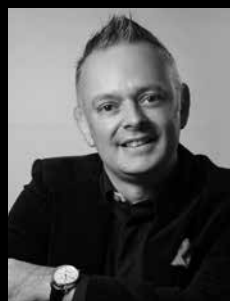
DION VERCOE PALLADIO - INTERIOR DESIGN CONSULTANTS

“The MET Corporate Towers is a vision refined and developed through the lens of our investors. We believe that the powerful synergy of Location-Concept-Pricing ensures a winning development we can all be proud to call our own.”