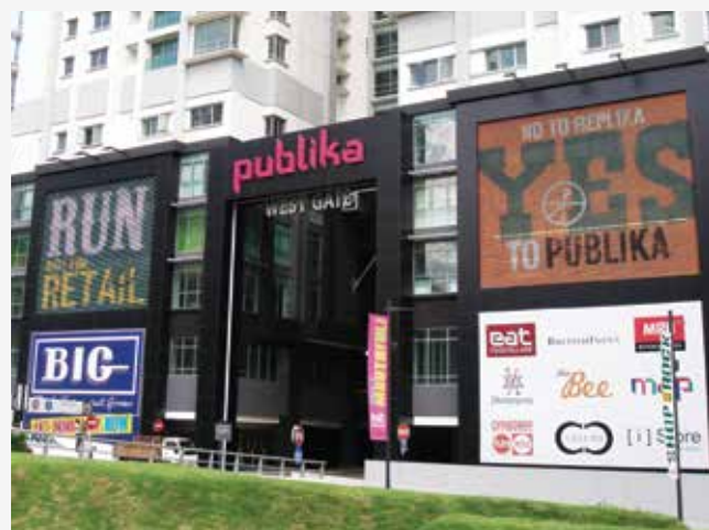
Solaris Dutamas has evolved Mont Kiara with its combination of commercial offerings and support for arts and culture