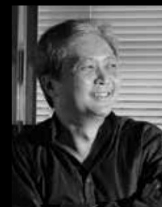
LEONG YEW KOOI GSD - ARCHITECTS

“The design intention is to create an environment where the demands of a fast-paced, work lifestyle are balanced by nature's calming ability.”